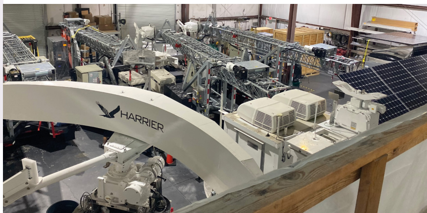
DeTect has manufacturing facilities in the US, Canada, Europe and Korea