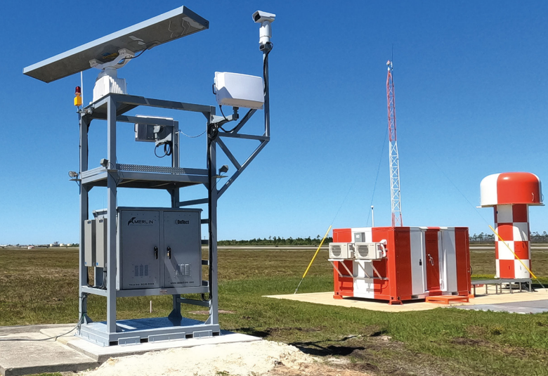
DroneWatcher- airfield installation

Balancing necessary information while de-cluttering background information is also a difficult task.