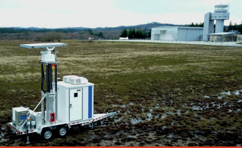
Model: Harrier S200 – GBDA