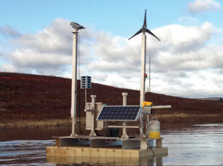
Model: MERLIN BCRS Floating Deterrent Unit (FDU)

DeTect's MERLIN BCRS is software controlled and allows for custom, user-defined control zones.