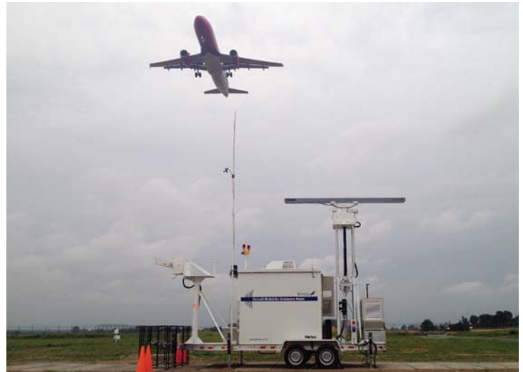
ABOVE: MERLIN Aircraft Birdstrike Avoidance Radar system installation at the Warsaw, Poland airport.