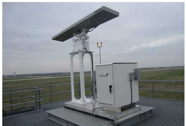
BELOW: MERLIN systems are also available in fixed, fully self-contained skid package units (MERLIN SS200d HSR sensor installation at US Air Force Whiteman AFB, Missouri USA.)

•The most widely used & tested bird radar system with over 180 units operating worldwide in aviation safety & bird control.