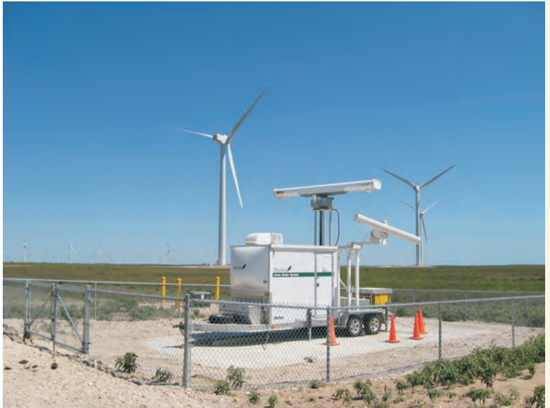
TOP: MERLIN SCADA installation at the Iberdrola Penãscal wind farm in Texas, USA (operating since 2009).

MERLIN SCADA provides real-time mortality risk mitigation for migratory birds, resident birds, raptors and bats with customizable rule sets and responses.