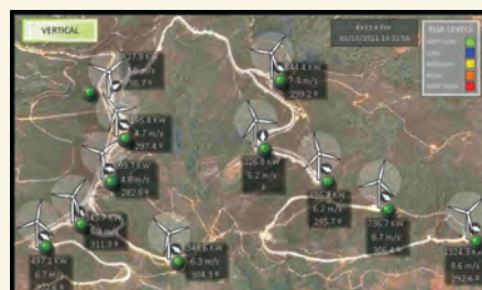
MERLIN SCADA-R interface for raptor mitigation using turbine centric model that idles individual turbines when proximate risk is detected; each turbine is assigned a color-coded risk value (El Pino wind farm, Spain)

MERLIN SCADA is the world's only radar-based wind farm risk mitigation system and provides continuous monitoring and automatic activation of mitigation measures to reduce mortality risk for migratory birds, resident birds, raptors and bats. The system applies rule sets programmed to respond to a variety of risk conditions in real-time activating mitigation measures that include operator alerts, turbine idling and activation of deterrent devices (long range bioacoustic and laser based).