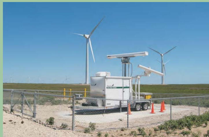
ABOVE: MERLIN SCADA installation at the Iberdrola Penascal wind farm in Texas, USA (operating since 2009)