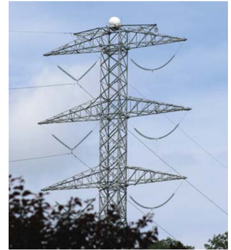
BELOW: HARRIER Utility tower installation